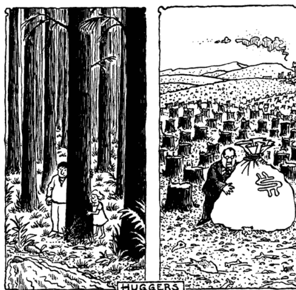
Figure 2. The Tree Huggers, by John Jonik. http://www.mindfully.org/Jonik/Tree-Huggers-Jonik.htm

The economists are right: the time it takes to grow timber is important. But, what they don't appreciate is that understanding time in forestry is not as simple as putting a dollar value on it. Despite the efforts of lawyers, what distinguishes forestry from other long term investments is that the trees are physically tied to the land. A mature forest is not like a piece of antique furniture or a vintage car – you cannot go out and buy one to replace the one you've lost. For a farmer to grow timber waiting is not just a cost, it is unavoidable. Time still needs to be lived. Rather than just being a source of income, forests are a capital asset, part of the farm's infrastructure.